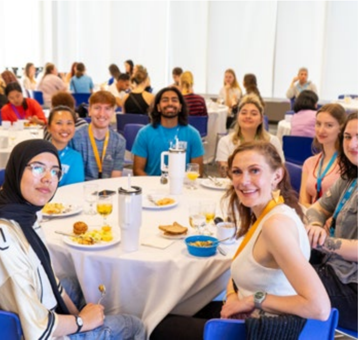
ACCOMMODATION AT LAKESHORE RESIDENCE